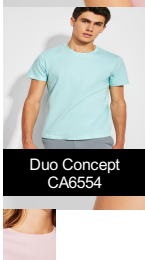
Duo Concept CA6554